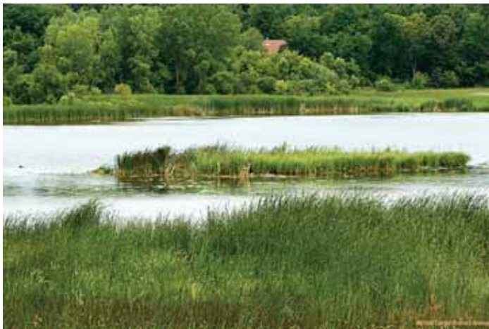
The floating island arrived near the Cherokee Park neighborhood in mid-July, 2008.

The island came to rest again not far up the river, and it has stayed in the same spot since that time. The picture below, taken on April 19, 2010, gives an idea of what is happening to the island, over time. It should be noted first that the pictures are not comparable, in two ways: one, in July, 2008, the island and the marsh on both sides of the river were covered with tall grasses, making them look more substantial; two, the island is now sitting at a point where the river is wider. Despite these differences it should be apparent that the island is now much narrower, and it is gradually being whittled away by the action of the wind and water. This wearing down of the bog has happened even though, in comparison with 2008, the weather has not been particularly severe, and the water level is currently about three feet lower than its maximum in 2008. In short, even without storms, water erodes, and it looks like this island will disappear altogether before very long.