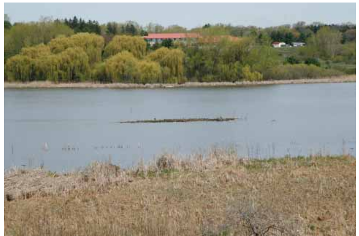
By April 19, 2010, the island was much reduced in size.